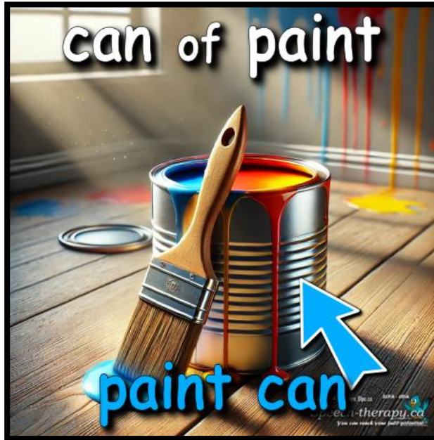
can of paint

Copyright © N. Sorensen 2025 Speech-therapy.ca You can read & your path continues